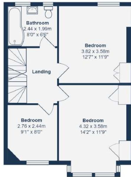
First Floor Area: 48.4 m 2 ... 520 ft 2