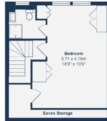
Second Floor Area: 34.4 m 2 ... 370 ft 2

Total Area: 139.7 m 2 ... 1504 ft 2 (excluding garden)