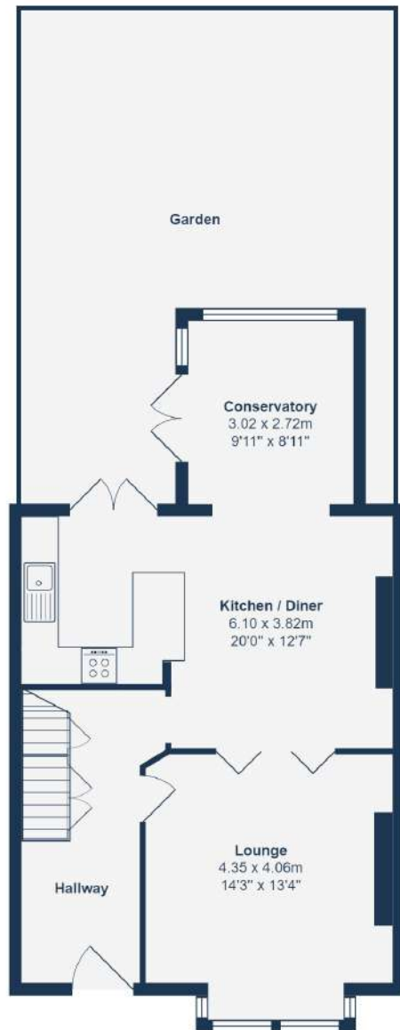
Ground Floor Area: 57.0 m 2 ... 614 ft 2