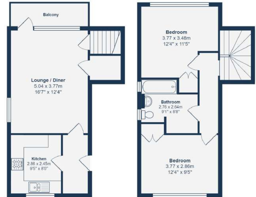
Ground Floor Area: 34.1 m 2 ... 367 ft 2