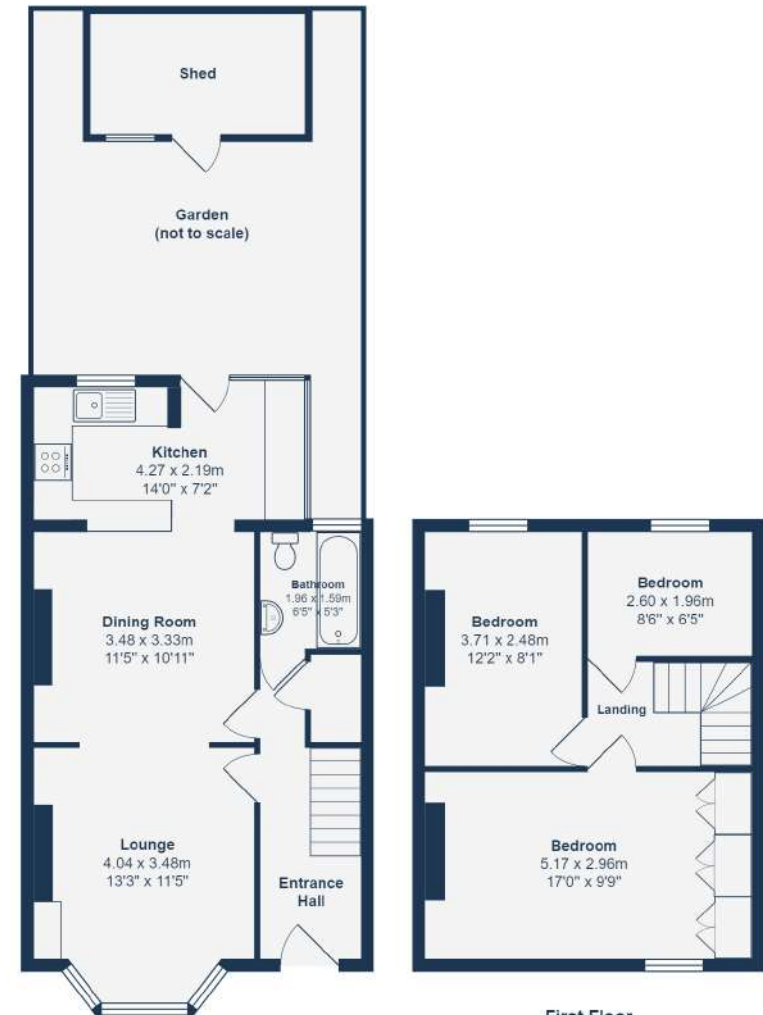
Ground Floor Area: 46.3 m 2 ... 498 ft 2

Decked seating area leading to laid lawn and raised flower bed borders with mature shrubs. Raised patio area to the rear with shed.