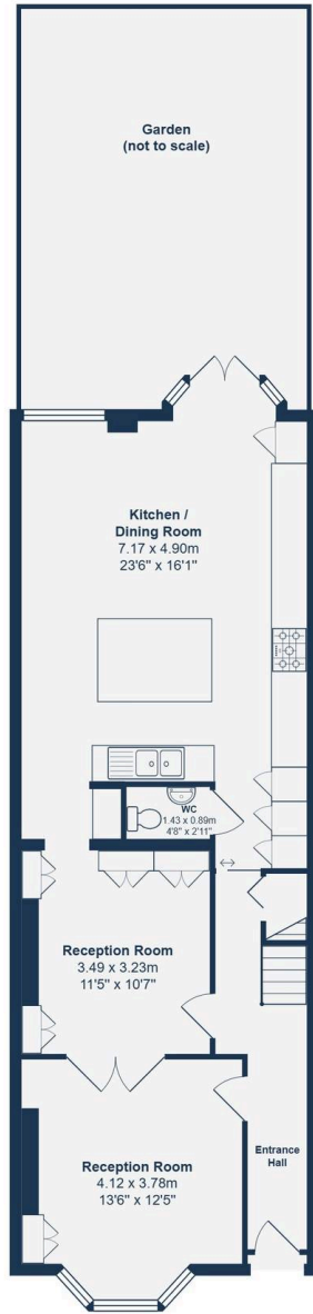
Ground Floor Area: 72.7 m 2 ... 783 ft 2