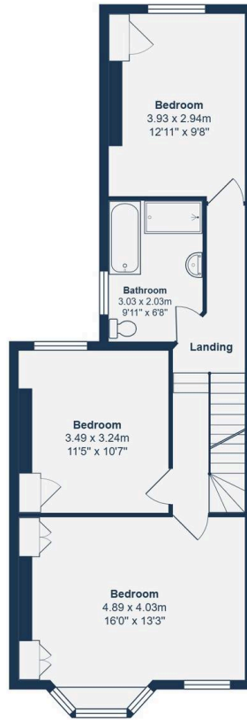
First Floor Area: 57.0 m 2 ... 614 ft 2