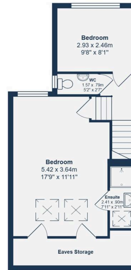
Second Floor Area: 34.9 m 2 ... 376 ft 2

Total Area: 164.7 m 2 ... 1773 ft 2 (excluding eaves storage)